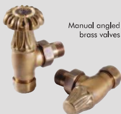
Manual angled brass valves