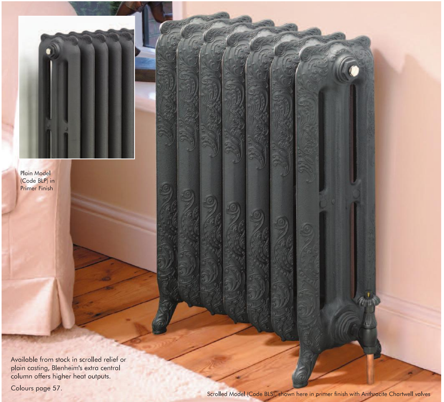
Plain Model (Code BLP) in Primer Finish

Available from stock in scrolled relief or plain casting, Blenheim's extra central column offers higher heat outputs.