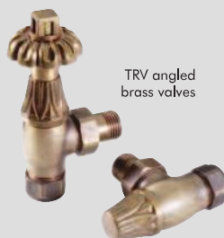
TRV angled brass valves