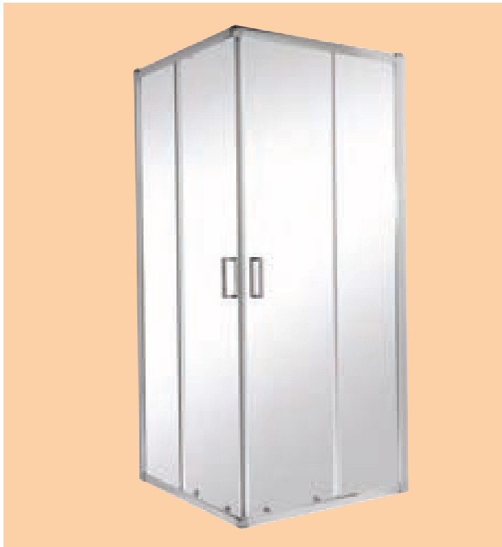
ES200 corner entry

6mm toughened safety glass click lock mechanism for quick assembly of horizontal profiles sliding doors swing out for easy cleaning