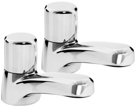
*shown with CHC SNUB C handles

Product Code: CHC ¾ C Finish: Chrome Product Type: Contemporary Construction: Body is of brass construction and is designed to conform to BS EN 200 Cartridge Type: 1/4 turn ¾" Ceramic Disc Valves Supply: Suitable for all plumbing systems Inlet Connections: ¾" BSP Working Pressures: Min 0.2bar, Max 5.0bar